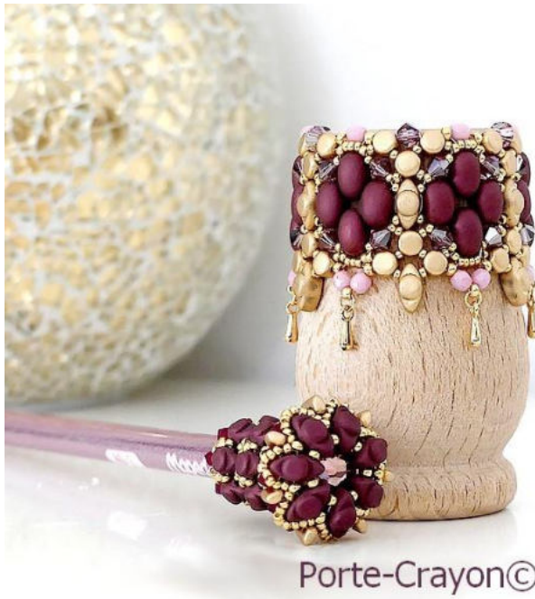
Porte-Crayon© par Puca®