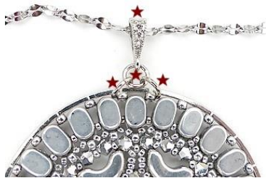
19) Insert jump rings, bail then chain and lobster clasp