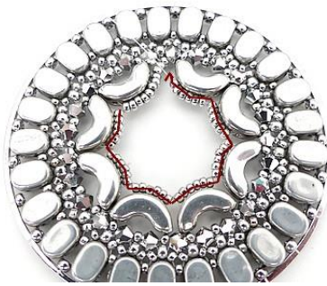
16) Pass to all SB15's