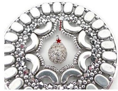
18) Insert teardrop or charm and reinforce