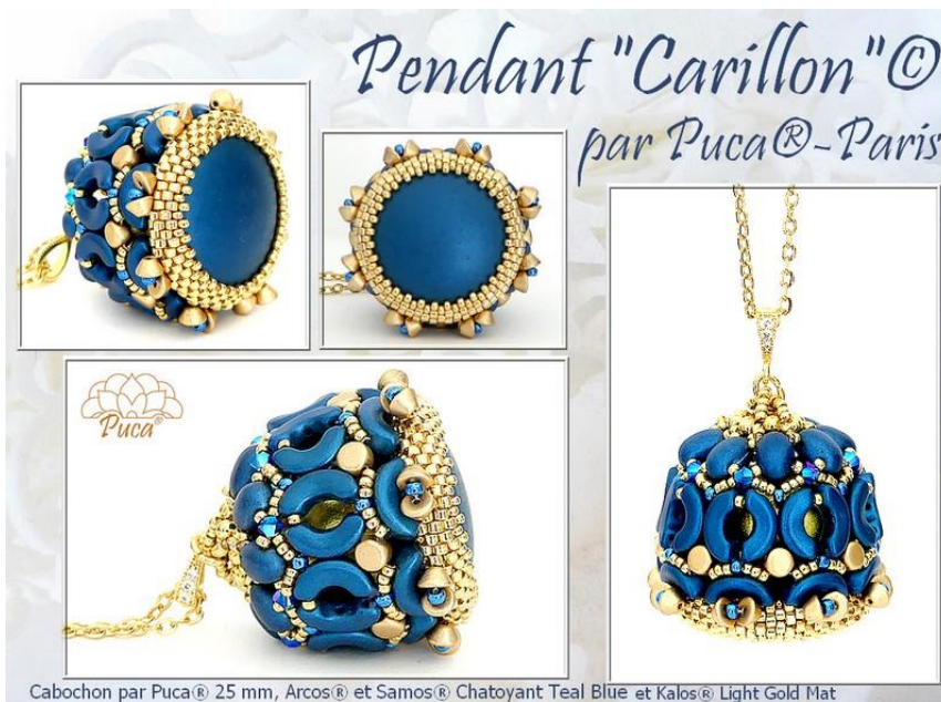
Cabochon par Puca® 25 mm, Arcos® et Samos® Chatoyant Teal Blue et Kalos® Light Gold Mat