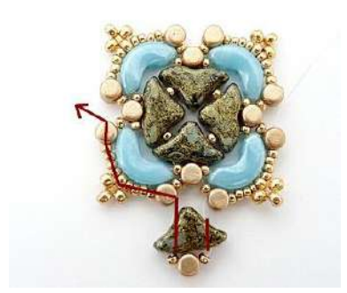
10) String 1 Helios, 1 SB15, 1 Minos, 1 SB15 and pass through the 2<sup>nd</sup> hole of Helios. Pass through the beads and go out through Minos.