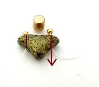
String 1 Helios, 1 SB15, 1 Minos, 1 SB15 and pass through the 2<sup>nd</sup> hole of Helios.