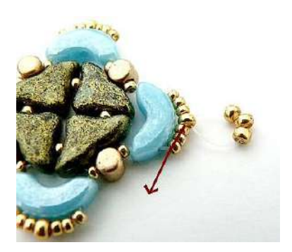
6) Add in a circle 3 SB11 by passing once again through the SB11 and then pass through the 3 SB15.