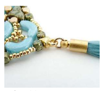
20) Add a jump ring to the Cymbal (or SB8) and then add the tassel.