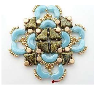
14) Repeat steps 12 and 13 all around. Go out through the 6 SB15.