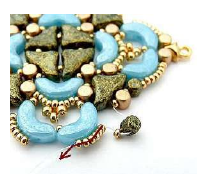
17) String 1 Minos, 1 SB15 and pass through the 6 SB15.