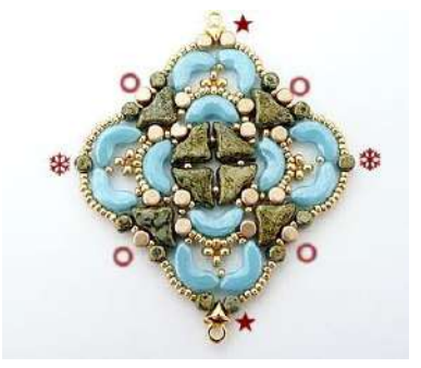
19) Repeat steps 15 to 18 all around.