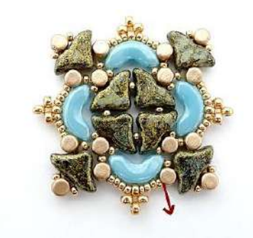
11) Repeat step 10 to add 1 Helios between each Arcos. Go out through Minos (red arrow).