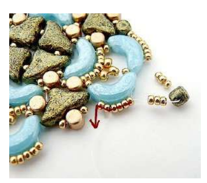
18) String 3 SB15, 1 Minos, 3 SB15 and pass through the 6 SB15.