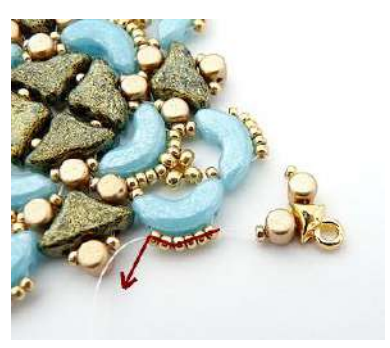
15) String 1 SB15, 1 Minos, 1 Cymbal (or SB8), 1 Minos, 1 SB15 and pass through the next 6 SB15.