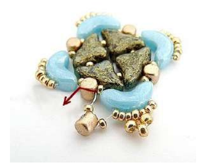
7) String 1 SB15, 1 Minos, 1 SB15 and pass through the next Minos.