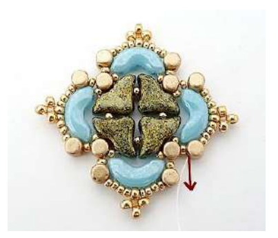
9) Repeat steps 7 and 8 for each Arcos. Go out through Minos (red arrow).