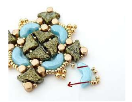
12) String 1 SB15, 1 Arcos, 6 SB15 and pass through the 3<sup>rd</sup> hole of Arcos.