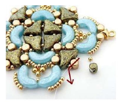
16) String 1 SB15 and 1 Minos. Pass through the SB15, Minos and SB15.