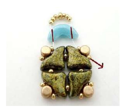
4) String 1 Arcos, 3 SB15, 1 SB11 and 3 SB15. Pass through 3<sup>rd</sup> hole of Arcos, and go out through the SB15 (after Minos).