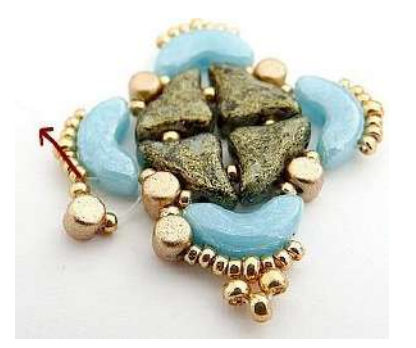
8) String 1 SB15, 1 Minos, 1 SB15 and pass through the 3 SB15 and SB11.