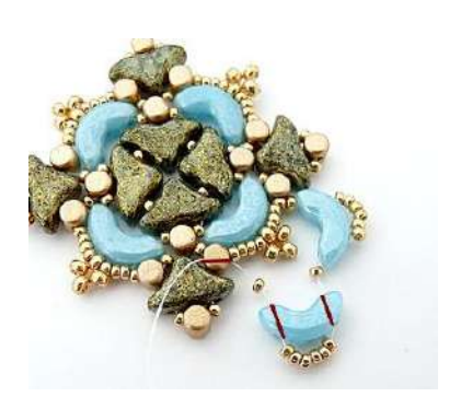
13) String 1 SB15, 1 Arcos and 6 SB15. Pass through the 3rd hole of Arcos, add 1 SB15 and pass through Minos.