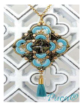
22) You have finished the pendant.