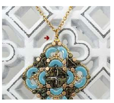
21) On the opposite side add a jump ring to the Cymbal (or SB8) and then add the chain.