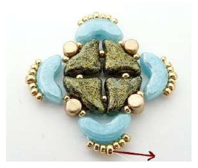
5) Repeat step 4 for each Helios. Go out through SB11.