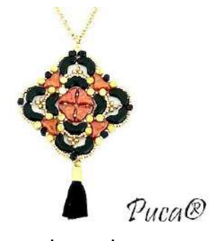
24) ... and another one with tassel.

Happy beading! Thank you for respecting my work.