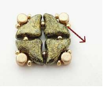
3) Repeat steps 1 and 2. After the 4th Helios, add 1 SB15 and pass once again through the 1<sup>st</sup> Helios to make a circle. Go out through the SB15 (after Minos).