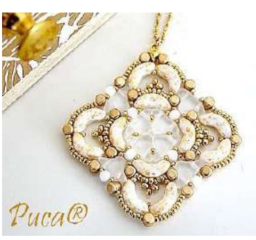
23) Another color combination.