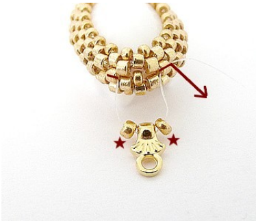
10) Pick up 1 R11, 1 Cymbal, 1 R11. Exit like picture