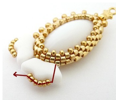
17) Pass through Delos again and through the 6 R15