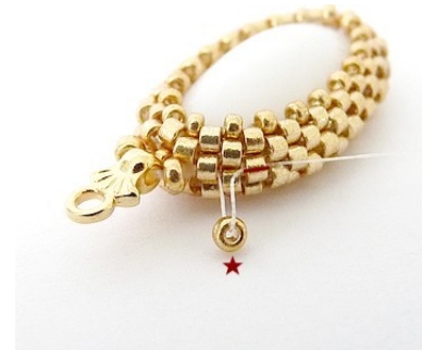
12) Pick up 1 R11 between the DB 11