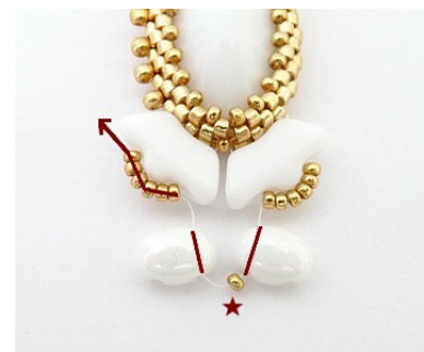
18) Pick up 1 Samos, 1 R15, 1 Samos and exit like picture