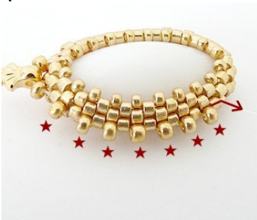
13) Pick up a total of 7 R11