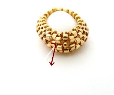
9) Exit like picture