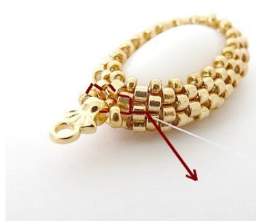
11) Repeat to strengthen and exit like picture