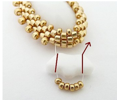
14) Pick up 1 Delos, 6 R15, exit through Delos