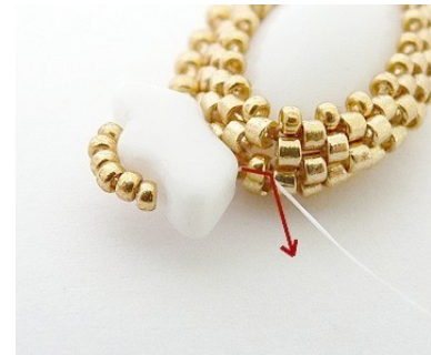
15) Exit through R15 like picture