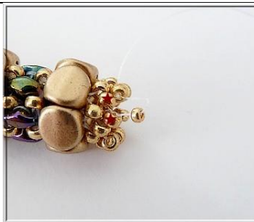
23) Make 2 Peyote ranks with R11