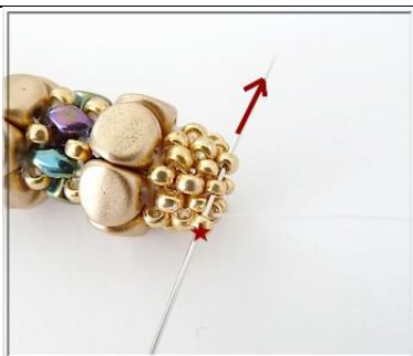
25) Pick up 1R15 then pass through the 2 R15 etc