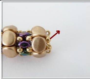
20) Exit through the R11 at the end