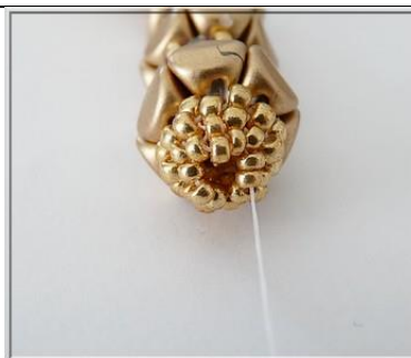
26) We have this 😊