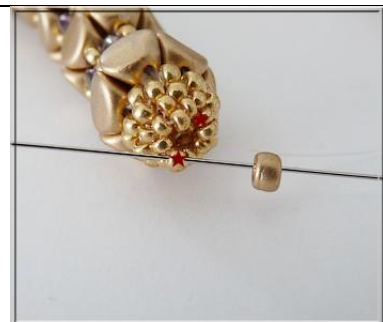
27) Pick up 1 R8 between the opposite R15, tighten 😊