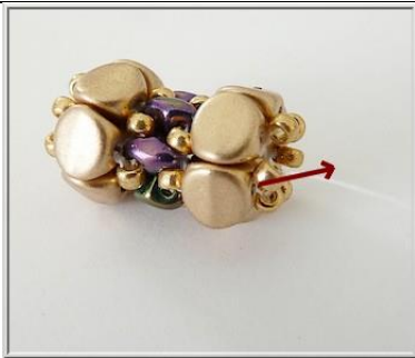
19) Exit through the R11 and repeat steps 7 to 19