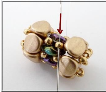
17) Pass through the R11