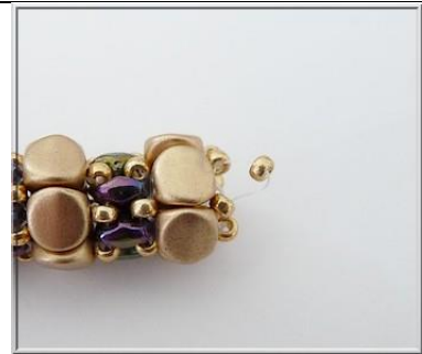
21) Pick up 1 R11 between the R11