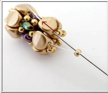
16) Zip like step 6