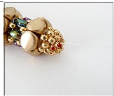
24) Then 2 Peyote ranks with R15