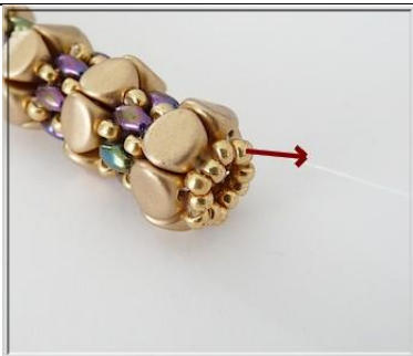
22) We have this 😊