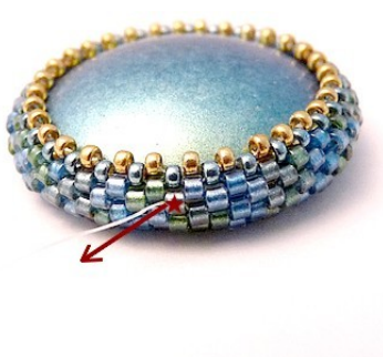
6) Exit like picture