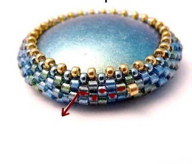
7) Pick up 1 DB and exit through the 5th DB like picture