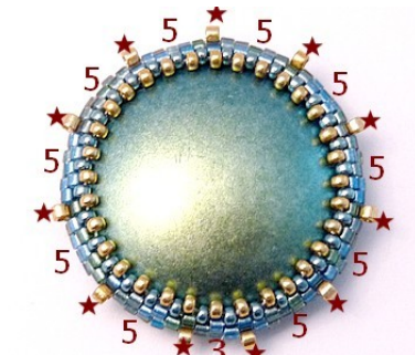
8) Repeat for the length of the pattern, you'll have 3 left DB