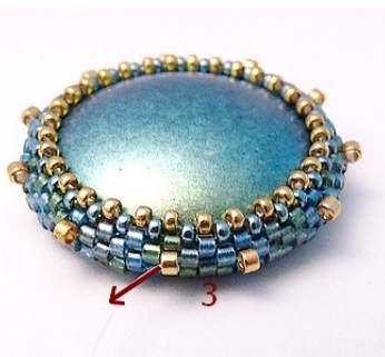
9) Exit like picture