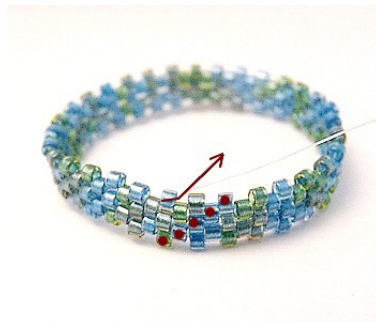
2) Bead 5 Peyote rows