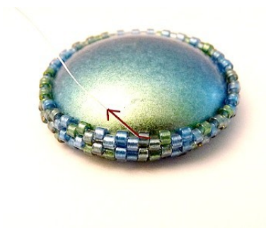
4) Place your cabochon and exit like picture