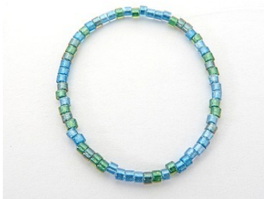
1) Pick up 64 DB11 and close