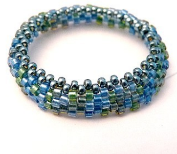
3) Bead 2 R15 rows