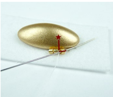
4) Come up through the backing again and pass through the 3rd DB