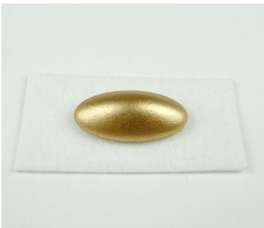
1) Glue the Athos on the backing . Let dry ☺