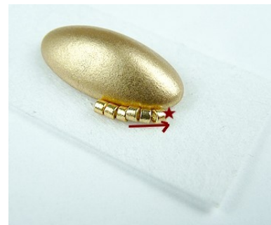
6) Repeat steps 4 and 5 for the length of the pattern