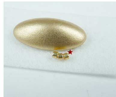
3) Pick up 3 DB11 and pass through the backing