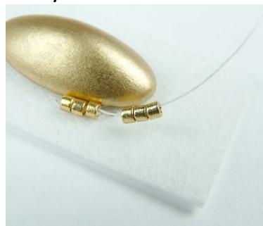
5) Pick up 3 DB11