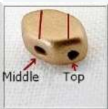
Paros - the orientation of the holes