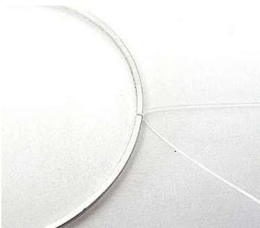
1) Tie a knot on connector circle.