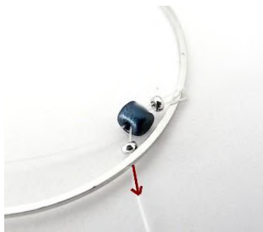
2) Add 1 SB15, 1 Minos, 1 SB15 and pass under the connector circle.