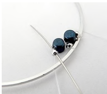
5) Repeat step 3. Then repeat steps 4 and 5 until you add 23 Minos.