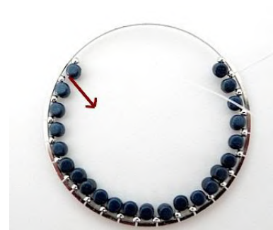
6) When you added the last SB15, go back through the last Minos added.