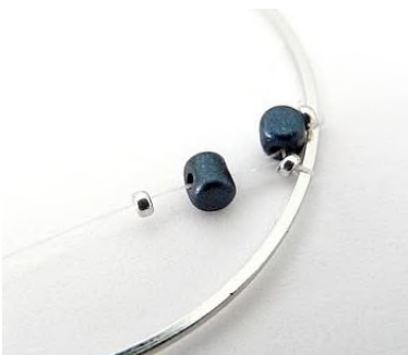
4) Add 1 Minos and 1 SB15.