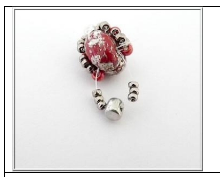
13) Pick up 3 R15, 1 Minos, 3 R15 into the Samos