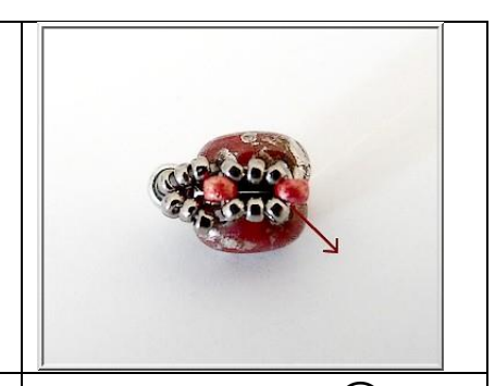
12) We have this Exit through the Samos