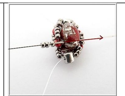
15) Pick up 3 R15 into the Minos