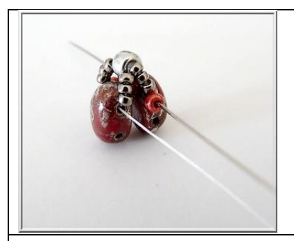
7) Pick up 1 R11 at the opposite side