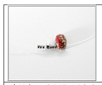
1) Pick up 3 R15, 1 R8, 3 R15, 1 Samos