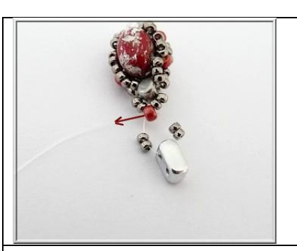
19) Pick up 2 R15, 1 los, 2 R15, exit through the R11