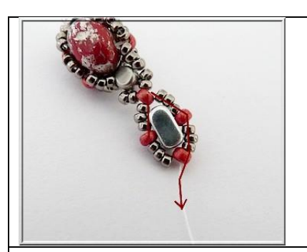
22) Pass through all the beads around the los to consolidate. Exit through the central R11.