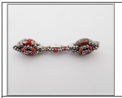
25) We have this ②. To make a necklace of 1m20, you must repeat 23 times