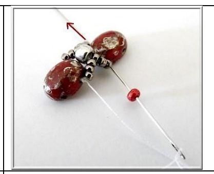
6) Pick up 1 R11 into the 2nd Samos