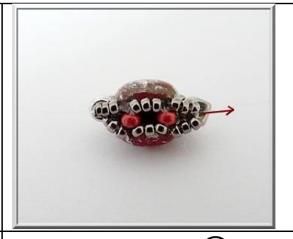
17) We have this Exit through the Minos