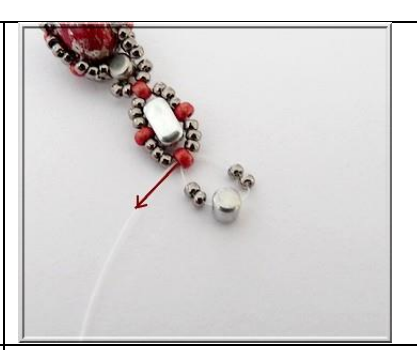
23) Pick up 2 R15, 1 Minos, 2 R15, exit through the R11