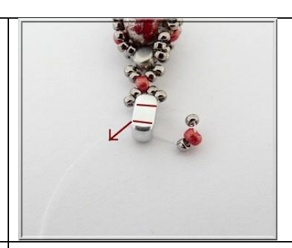
20) Pick up 1 R15, 1 R11, 1 R15 in the los side. Repeat for the other side