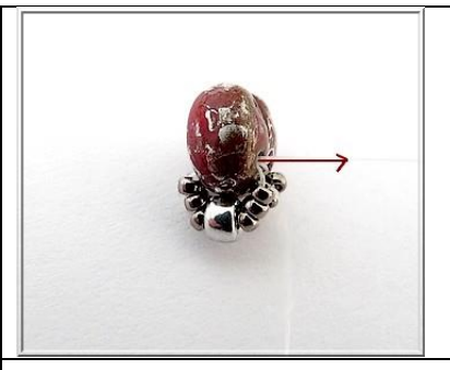
5) Samos are back to back, exit through the Samos