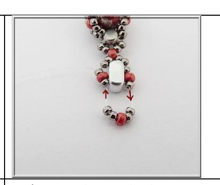
21) Exit through the R15 and pick up 2 R15, 1R11, 2 R15 into the R15