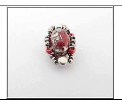
14) Exit through the Samos above