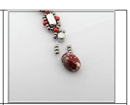
24) Pick up 3 R15, 1 Samos, 3 R15, exit through the Minos. Repeat steps 2 to 24