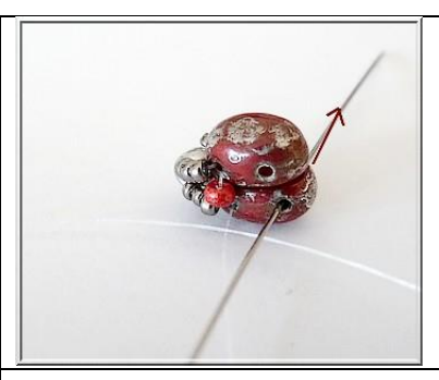
8) Exit through the Samos, in the down hole