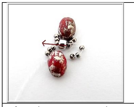
4) Pick up 3 R15 and pass through the R8