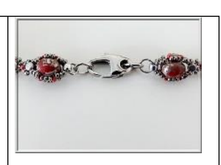
26) Place your clasp with rings into the R8