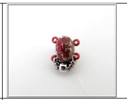
9) Pick up at least 4 R11 like step 7