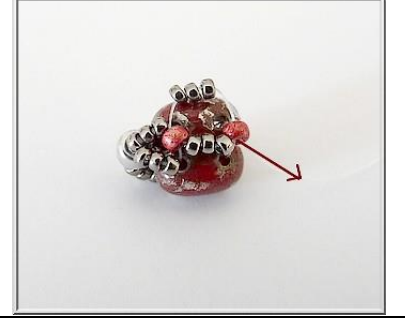
11) Pick up 3 R15 into the 2 R11