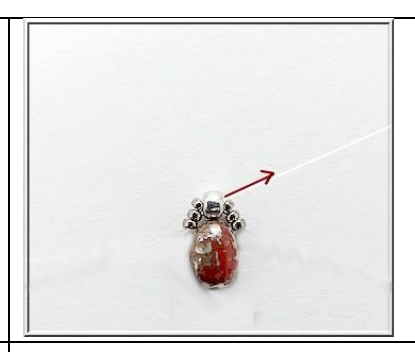
2) Pass through the same Samos and exit through the R8