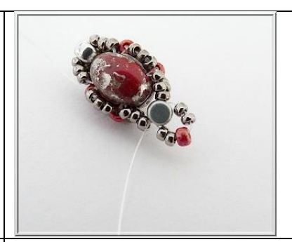
18) Pick up 2 R15, 1 R11, 2 R15, exit through the Minos