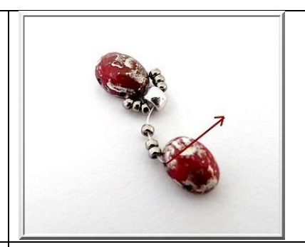
3) Pick up 3 R15, 1 Samos