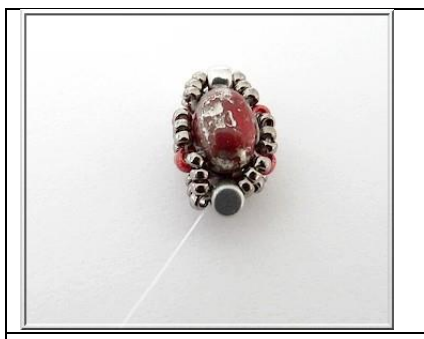
16) Pick up 3 R15 into the Samos